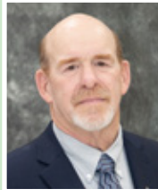
Candidate for Voting District C, Representative District 9