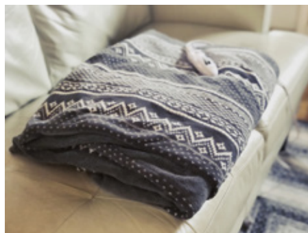
Electric blankets deliver quick warmth and include a variety of features like timers and dual temperature settings.

1. Whether you're experiencing extremely cold winter temps or you simply "run cold," an electric blanket can deliver quick warmth like a regular throw or blanket cannot. Electric blankets can include a variety of features, like timers and dual temperature settings (if your cuddle buddy prefers less heat). This winter, consider an electric blanket instead of turning up the heat, and your energy bill will thank you.