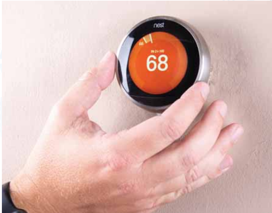
During winter months, set your thermostat to 68 degrees when you are home. Got a Wi-Fi controlled thermostat? Call us about a rebate!

2. Button up your home. The Department of Energy estimates that air leaks account for 24% to 40% of the energy used for heating and cooling a home. Caulking and