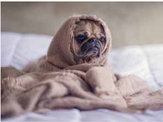
Get cozy under your favorite blanket for additional warmth. Don't forget to bundle up your furry friends, too.

Winter months often bring some of the highest energy bills of the year. By being proactive about saving energy, you can increase the comfort of your home and reduce monthly bills. Visit our website at www.enerstar.com for additional energy-saving tips and rebates available for upgrading your HVAC system.