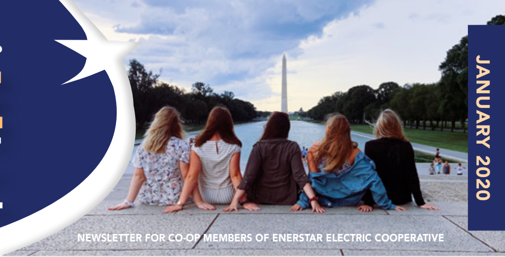
NEWSLETTER FOR CO-OP MEMBERS OF ENERSTAR ELECTRIC COOPERATIVE